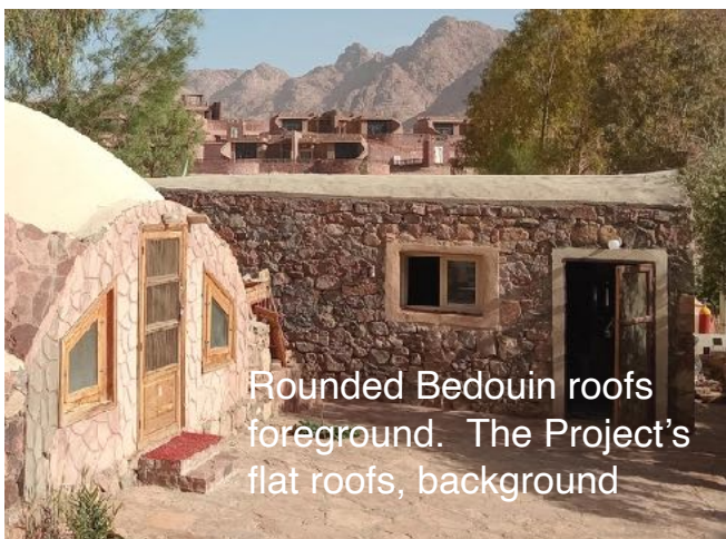
Rounded Bedouin roofs foreground. The Project's flat roofs, background

"How did The Project buildings hold up?" I asked my Bedouin friend and with a concerned shake of the head he replied, "Their roofs leaked". The Project, is the name of the building work the Egyptian government is undertaking at St Katherine's. Its design is grand, for the attention and use of an international and elite audience. It is also ill thought out to its surroundings and beset with one issue after another. Its name, I fear, will be self-fulfilling; ever the project and never the